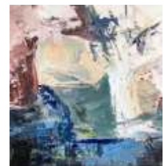
The above acrylic painting is by Grace Snively.