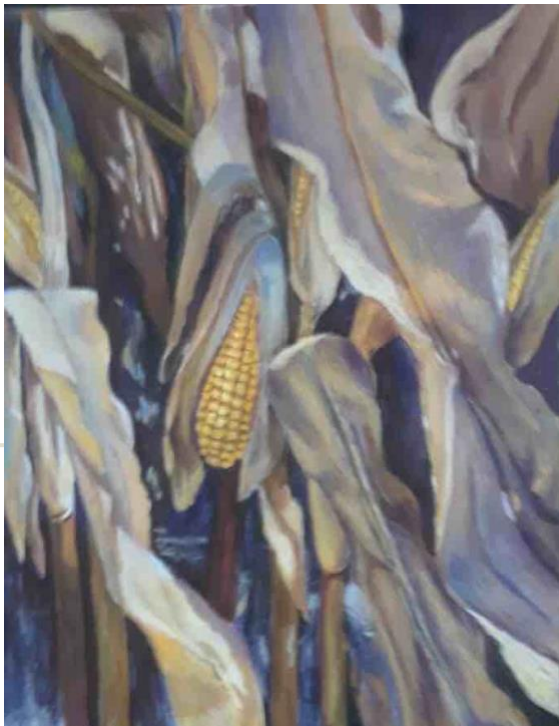
Corn - pastel