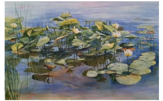
The above watercolor painting is by Sharon Zimmerman. Lotus II is 20x30 and framed for $550. It is available for sale on the Gallery website. www.gallery510.org