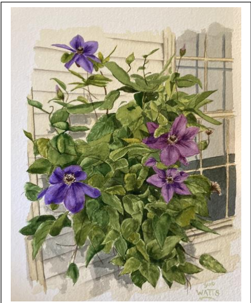
Purple Haze - 11x14 - $175