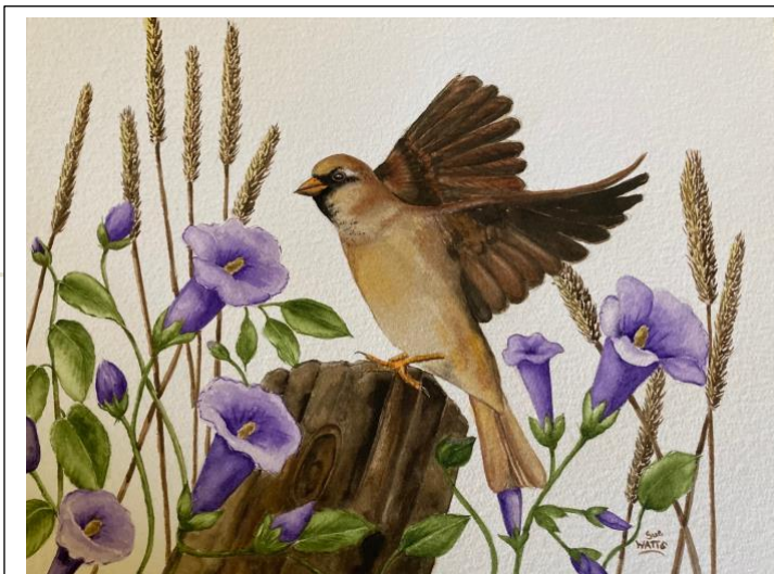
His Eye is on the Sparrow - 18x14 matted & framed - $215

Whether Covid, personal health, or any other difficulties of 2020, we all have struggled so much this past year. It looks like, with a little bit of luck, we can put this behind us, or at least no longer in front of us!