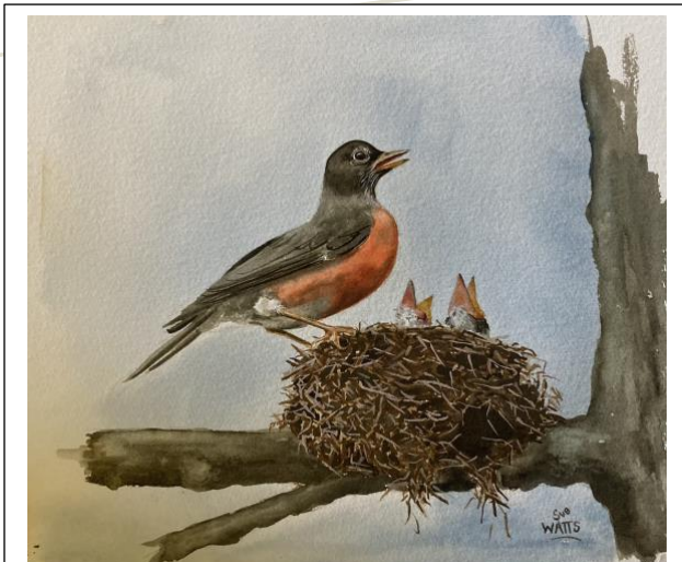
Mama - 14x11 matted & framed - $195