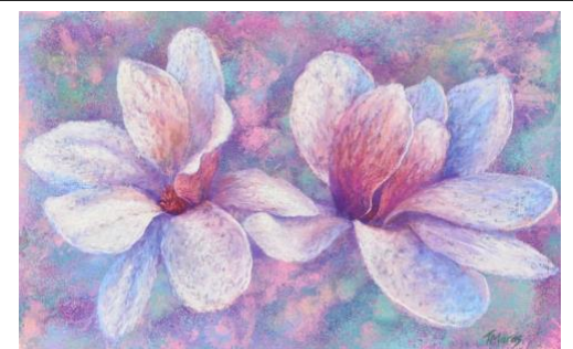
"And They Touched" above is by Tracey Maras. It features an underpainting technique she calls Floating Pastel . In this case, pastel dust is floated on a sheen of water, allowing it to flow into an abstract pattern. Once dry, this abstract pattern adds texture and dimension to the painting.