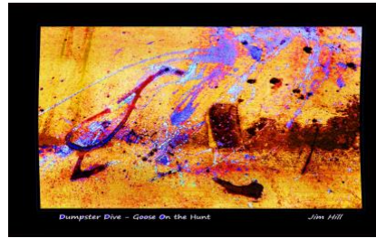
Above is a digitally manipulated photograph by Jim Hill "Goose on the Hunt 3a"