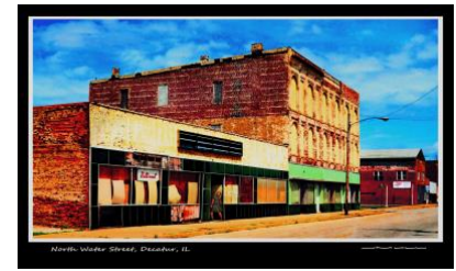
Above is a digitally manipulated photograph by Jim Hill "Buttenut on N. Water St."