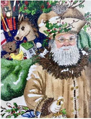
Above watercolor painting is by PAM MARTY . It's now available at Gallery510.