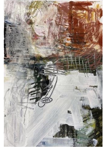
GRACE SNIVELY will be featured in February at Gallery 510. First Friday is February 3.