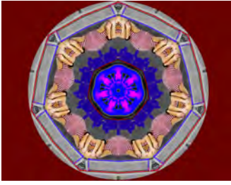
Jim Hill “Kaleidoscope” Study #318