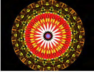
Jim Hill – “Kaleidoscope” Study #254