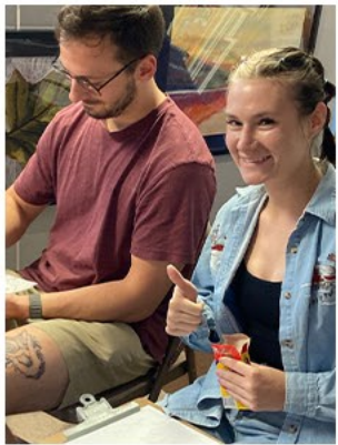
Above: Attendants at our "Poetry and Sound Healing" Night.

Right: "Poetry and Sound Healing" at Gallery 510