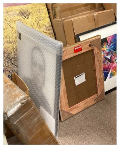
Above: Artwork coalescing for the October National Exhibit. Opening reception is October 6th.