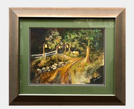
Above and to the left: 3 recent custom framing jobs.