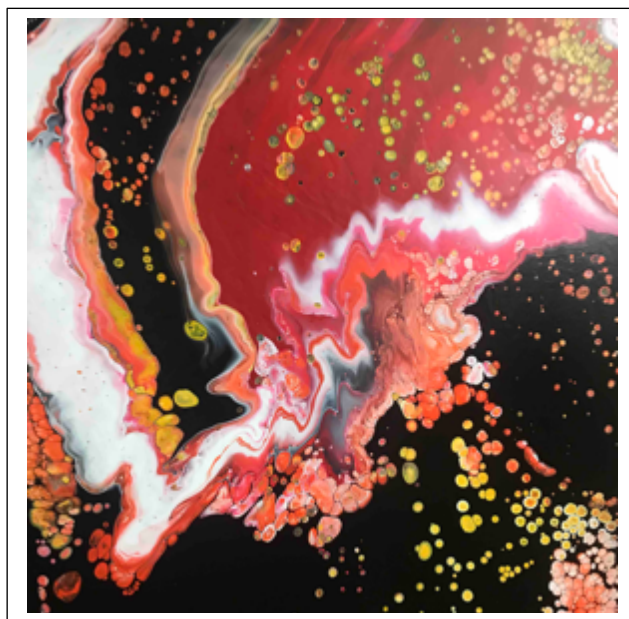
The above painting is titled "Strike", $45 Painting to the left is titled "Solar Explosion", $40